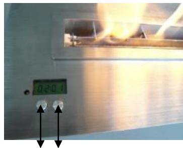
tank opening 2 1 on/off switch