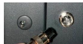
dry contact for home automation